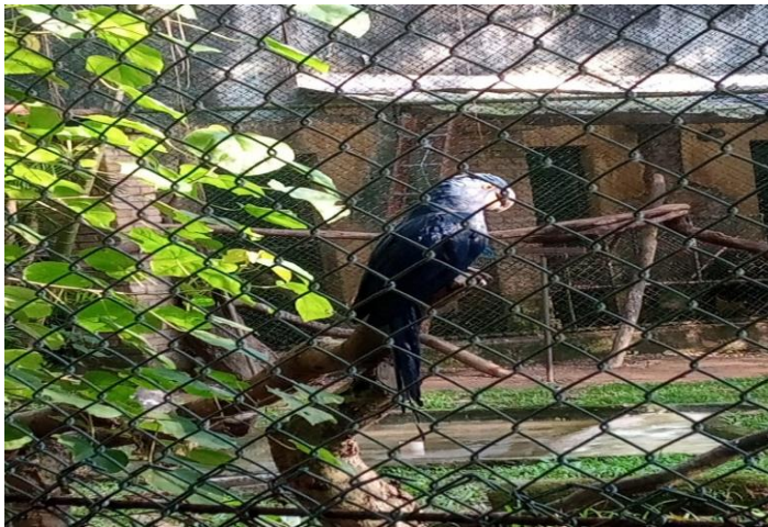
Orchid nursery and zoobotanic park