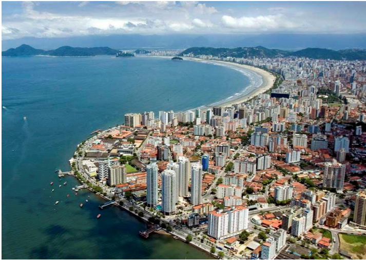
Panoramic view of the city of Santos